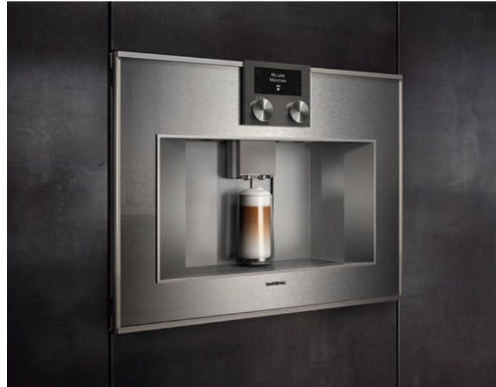
Fully automatic espresso machine 400 series