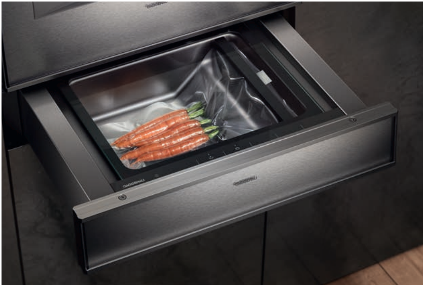
Vacuumping drawer 400 series