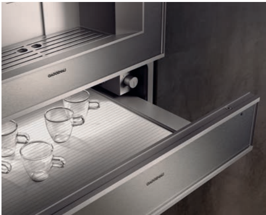
Warming drawer 400 series

Each of the three sizes of warming drawer are incredibly versatile kitchen appliances. Adjustable heating allows you to achieve perfect slow cooking results, proof dough professionally, defrost or brown with ease, gently melt chocolate or mature yoghurt. The Home Connect function further expands the drawer's repertoire, providing recipes specifically for the drawer, more programmes and a timer function. Alternatively, simply, expertly, warm cups and plates.