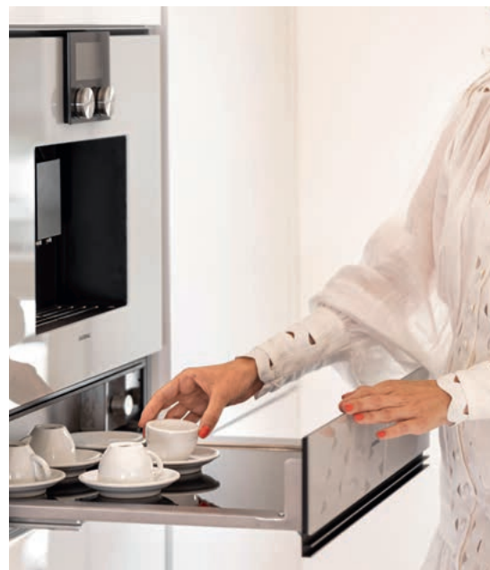
Fully automatic espresso machine and warming drawer 200 series

The warming drawer comes in two sizes, and offers a wealth of culinary opportunities. Use it to slow cook, proof dough, defrost, brown, melt chocolate and mature yoghurt. Open the Home Connect app to unlock recipes and further programmes that make full use of its powers as well as a handy countdown. And don't forget you can still warm coffee cups and dinner plates.