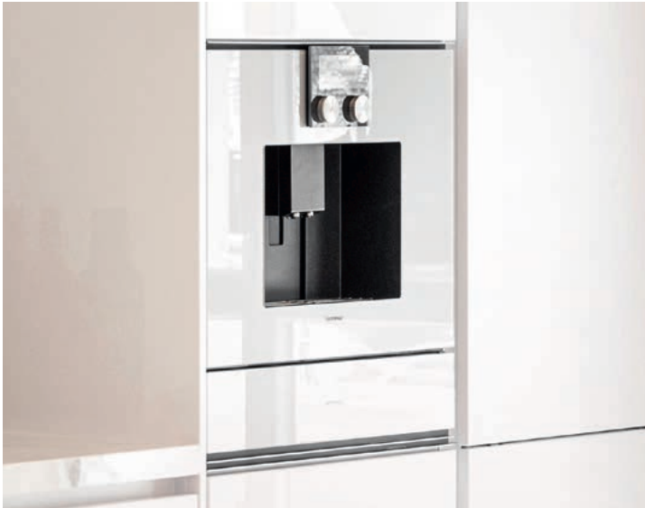
Fully automatic espresso machine and warming drawer 200 series